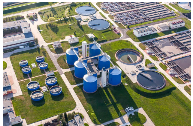
Removal of coarse material from the inlet of large sewage treatment plants, e.g. China: 3 x TrashLift 16140 x 1700 with 20 mm gap width and 75° machine setup.