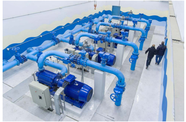
Removal of coarse and impurities in pump stations to protect downstream units, e.g. Qatar: 2 x TrashLift 17300 x 1220 with 50 mm gap width and 85° machine setup.

from river, sea and sea water, as well as for wastewater treatment in the following areas of application: