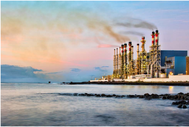
Raw water for seawater desalination systems.

The HUBER Grab Screen TrashLift is used as a coarse or fine screen for the treatment of process/service water