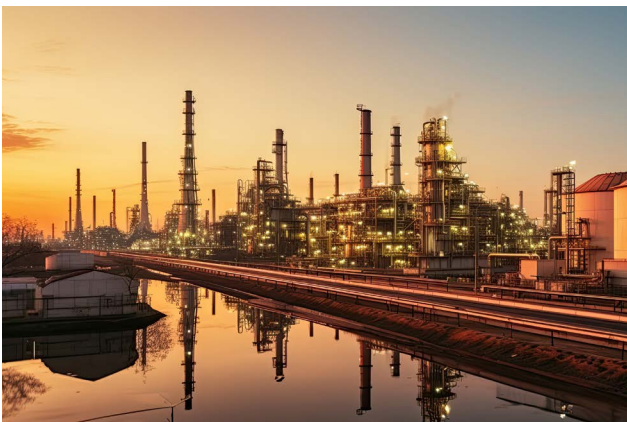
Process and cooling water for chemical plants and thermal power plants, e.g. in Germany: 1 x TrashLift 9425 x 2000 with 16 mm gap width and 90° machine setup.