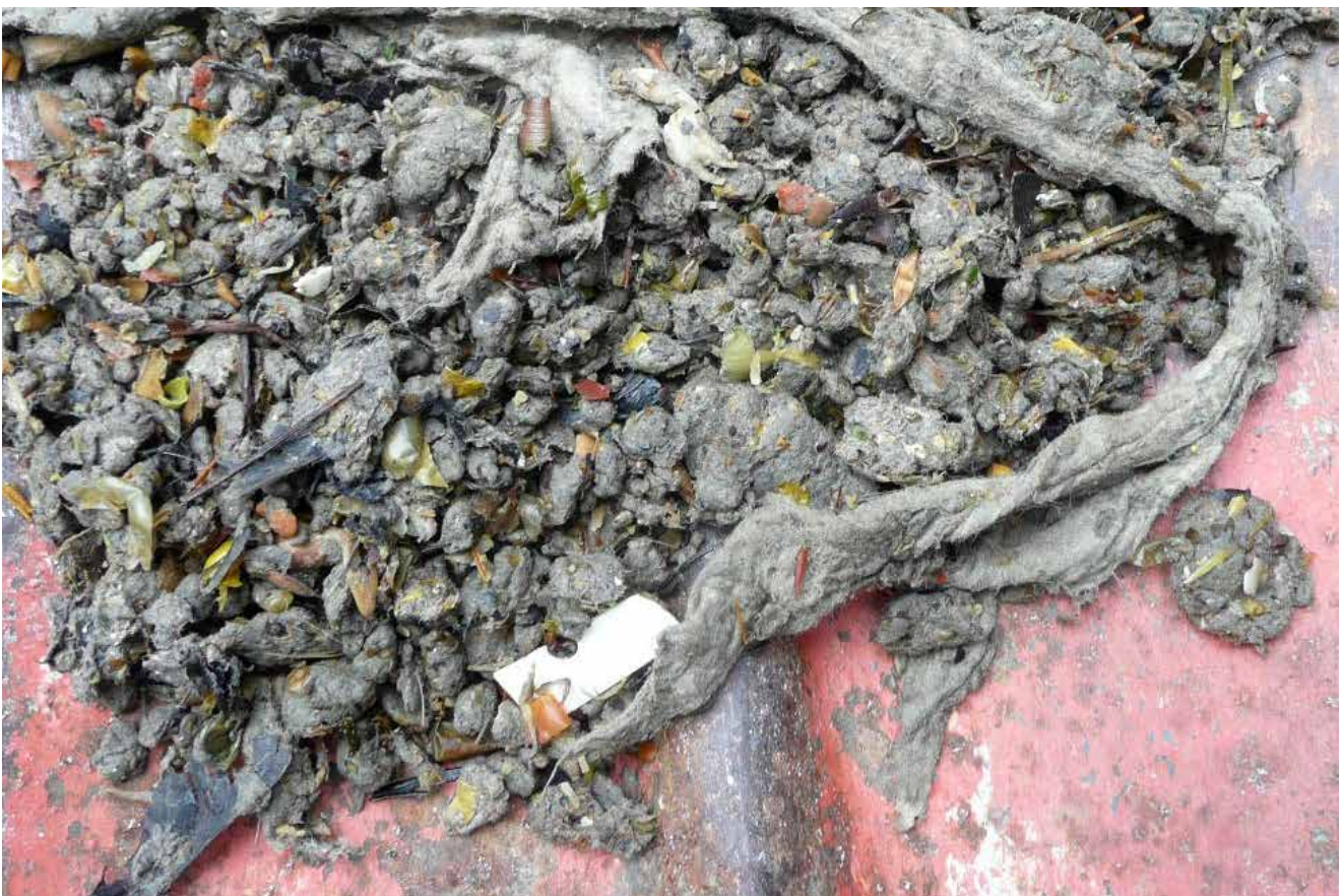
Separated material: wet wipes, leaves, plastics, foils, packaging residues, textiles, etc.