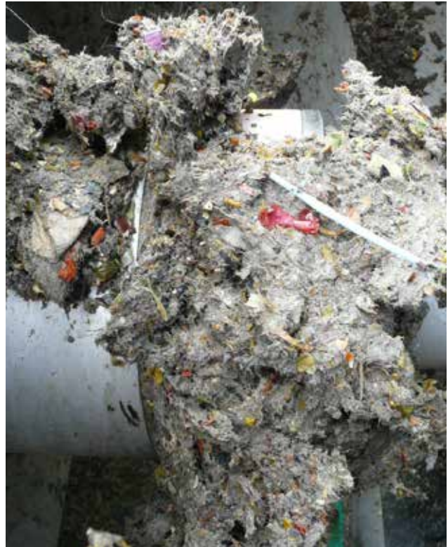
Discharge of the separated dewatered material.