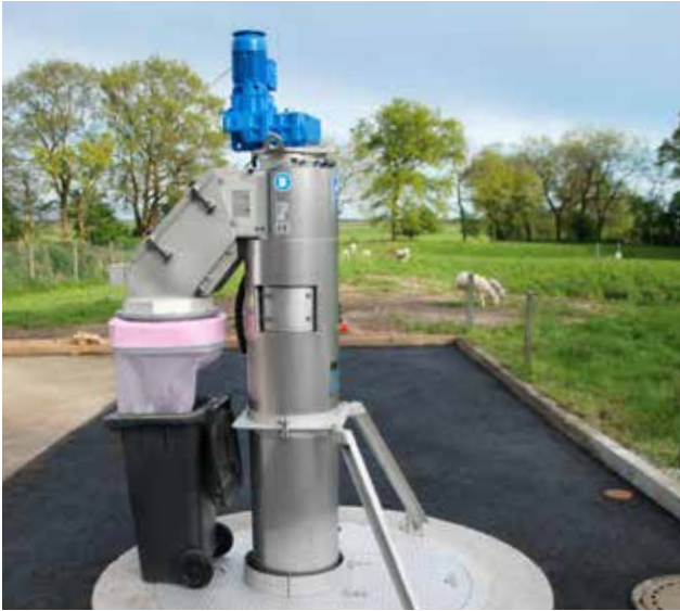
Heated outdoor installation with endless bagging device for screenings disposal.

A selection of installation examples will convince you of the HUBER Pumping Stations Screen ROTAMAT® RoK4.