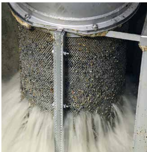
HUBER Pumping Stations Screen ROTAMAT® RoK4 in operation.