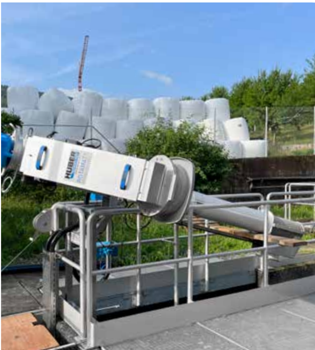
"Quick swing-out system" with cable pull for easy maintenance access outside a channel installation situation.