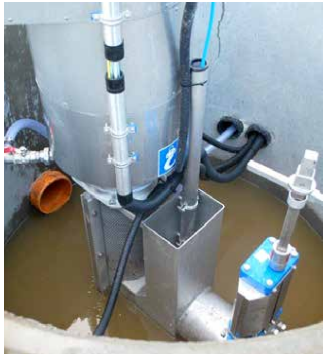
View of the screen basket in operation.