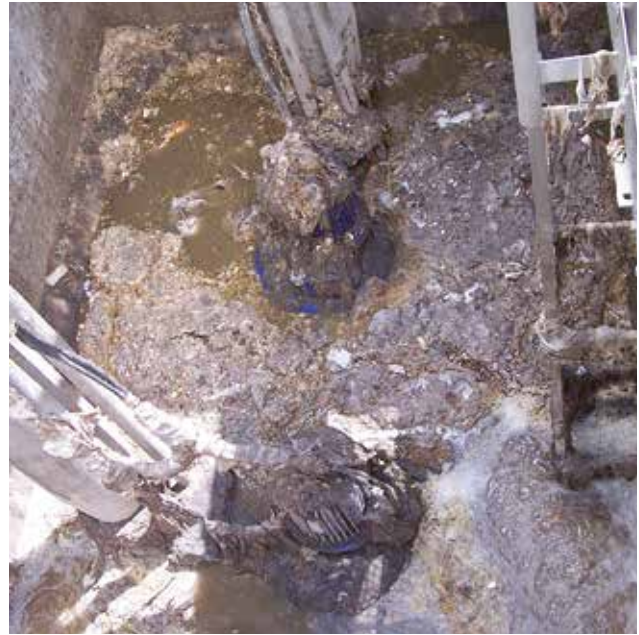
Clogged pumps caused by the solids within the medium to be delivered.

The top of the lateral inflow chamber is open and serves as an emergency bypass so that the machine can be submerged without problems, e.g. in case of a power failure. The integrated bottom step prevents back-flooding into the sewer system and thus undesired deposits in the incoming sewer.