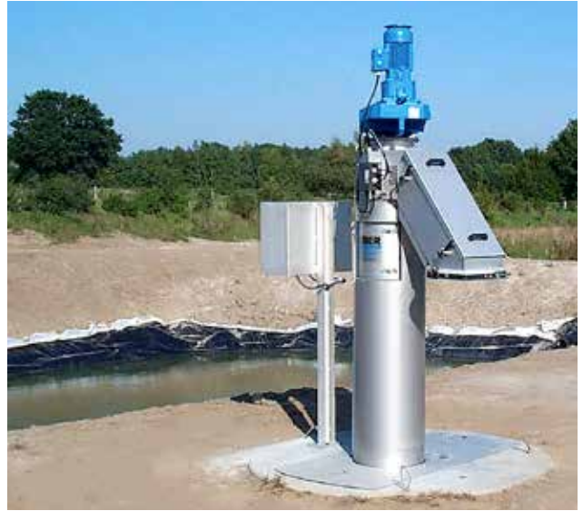
Installation upstream of a pond plant.