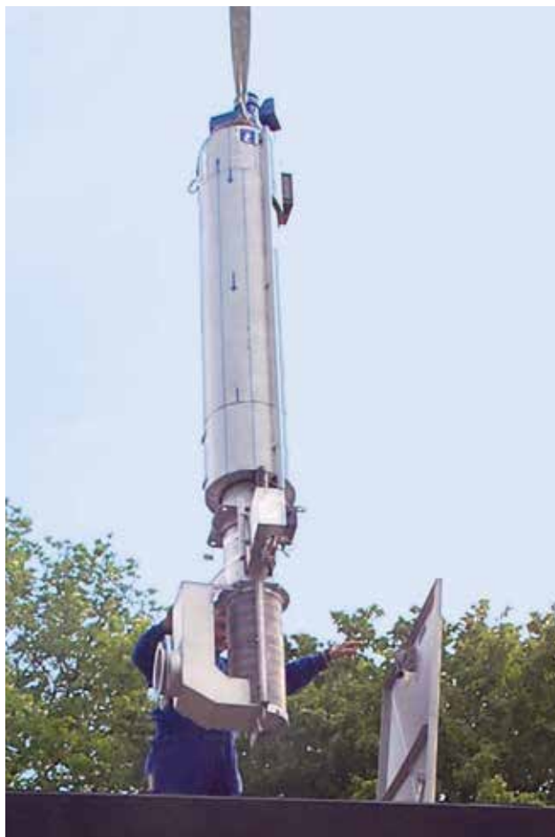
HUBER Pumping Stations Screen ROTAMAT® RoK4 being lifted into a pumping station.