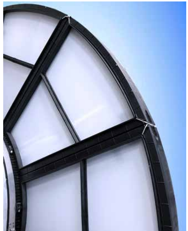
Disc-shaped screen element with a mesh size under 20 \mu\text{m} .

Due to its small space requirement and modular design the HUBER Disc Filter RoDisc® can be tailored to suit any specific site requirements.