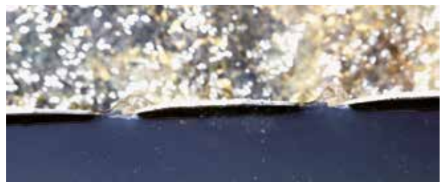
Activated sludge flocs sometimes are insufficiently retained by the secondary clarifier.