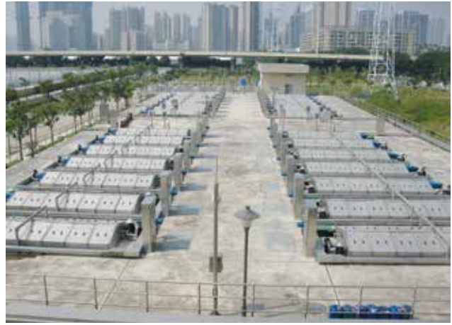
28 HUBER Disc Filter RoDisc® units with 24 discs each treating about 8.5 m 3 wastewater per second.