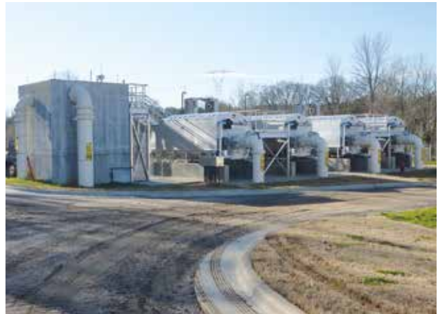
4 HUBER Disc Filter RoDisc® with 18 discs in stainless steel container.