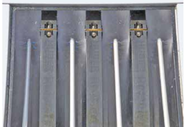
Backwashing of filter discs with filtrate – no external wash water required.