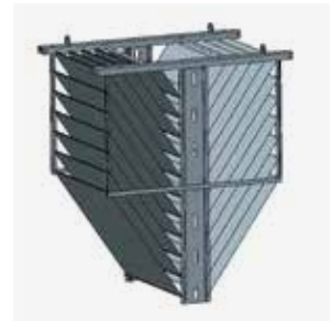
Lamella unit installed in the HUBER Grit Trap GritWolf®.