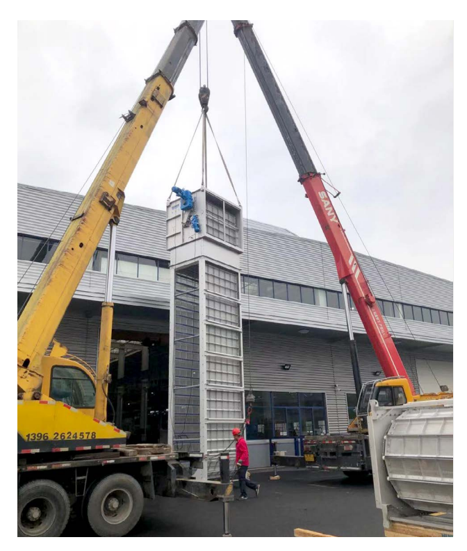
Delivery and installation of a HUBER Belt Screen CenterMax®.

For environmental reasons, the machine can be designed to protect aquatic creatures with fish buckets, which safely remove fish accumulating upstream of the screen and return them to the water body using a launder channel.