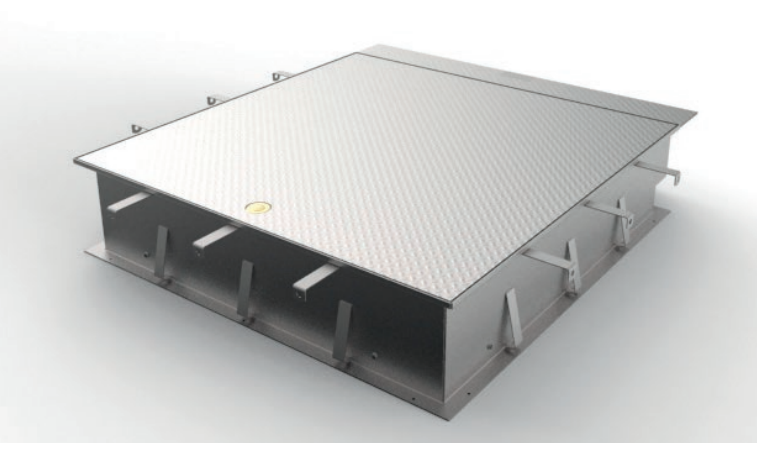
The figure shown here may contain special accessories.

Manhole cover, installed flush with the surface for pedestrian and/or vehicle traffic, optionally in class B125, D400, E600, weatherproof, odour-tight against pressureless water, attack-proof, rectangular in shape, made of 1.4307 (AISI 304 L) stainless steel.