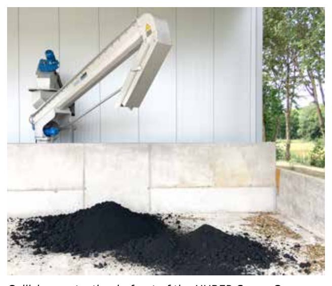
Collision protection in front of the HUBER Screw Conveyor Ro8 TC.