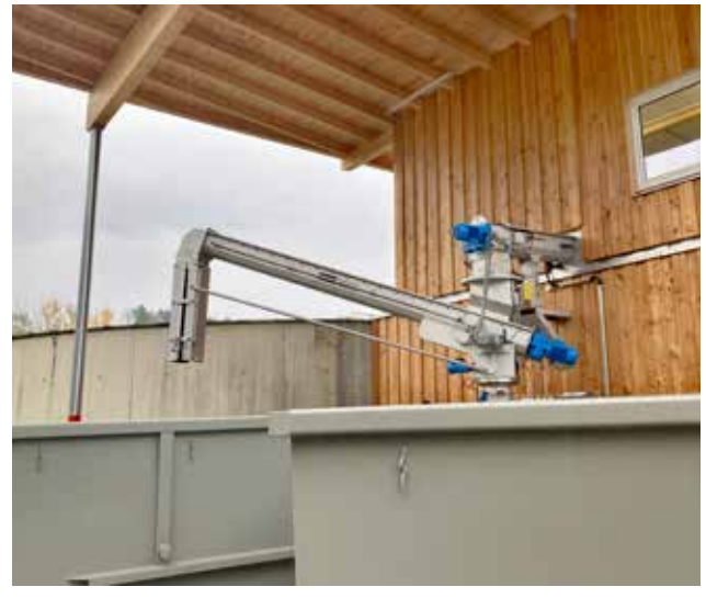
Containers are filled by the Ro8 TC with automatic chute and automatic swivel drive.