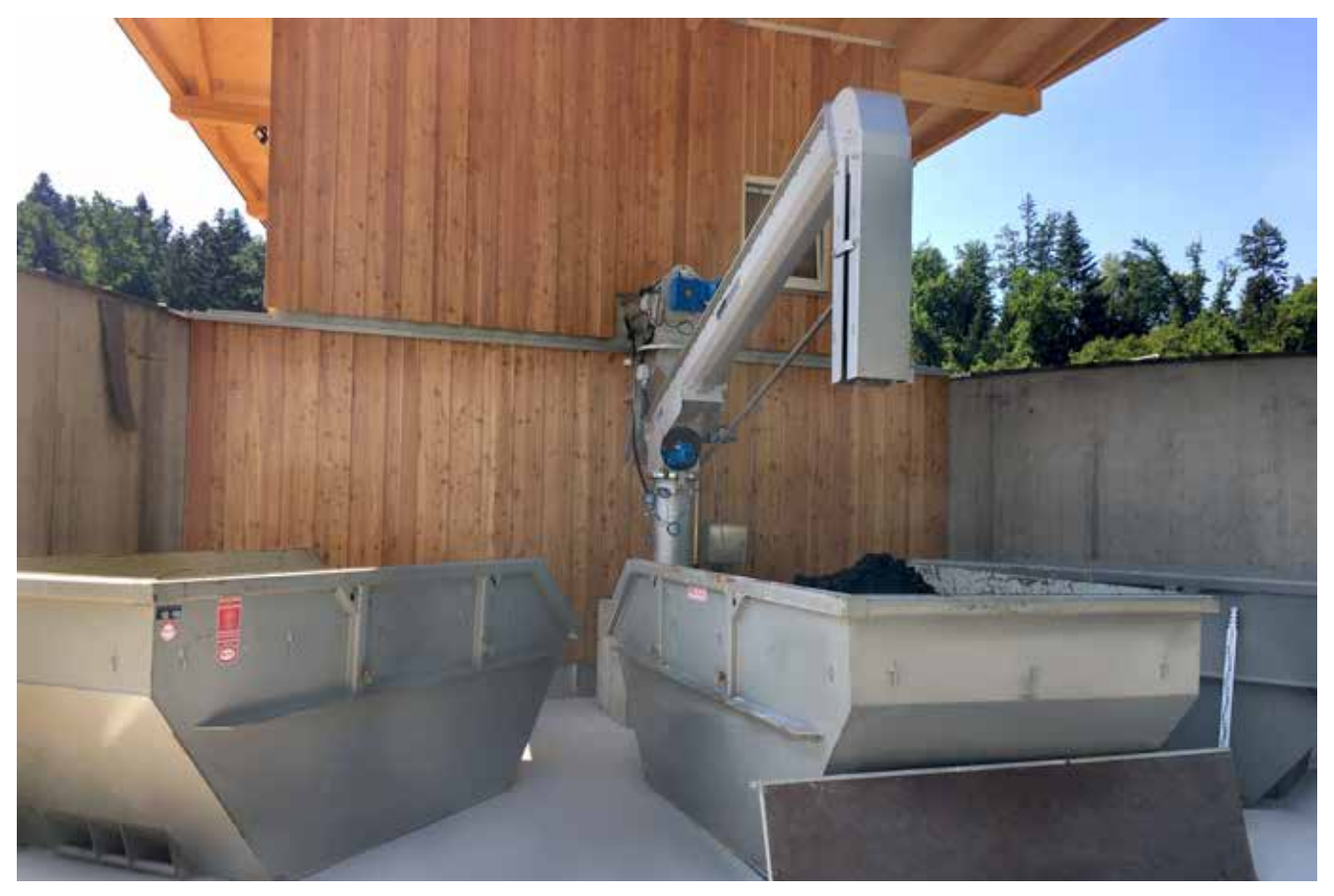
Star-shaped arrangement of the containers.

With regard to space, care must be taken to ensure that the containers are lowered to the same place in a reproducible manner. Simple markings on the floor are sufficient.