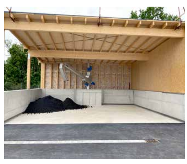
Sludge discharge through the Ro8 TC to a free area...