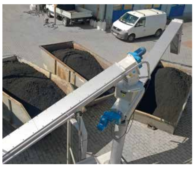
... or in containers.