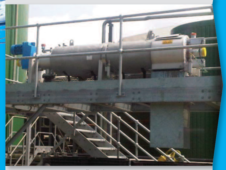
STRAINPRESS® at Andigestion