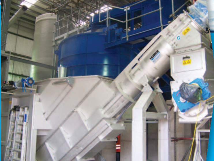
Light Fraction Screen at Bredbury Parkway