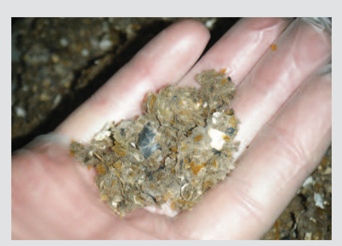
Unwanted plastic particles removed