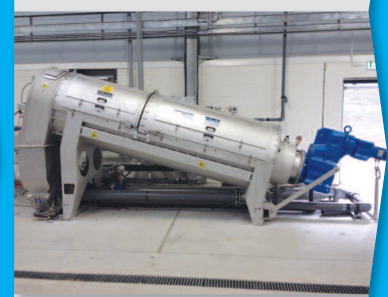
Q-PRESS® Installation at Diageo Glendullan Distillery